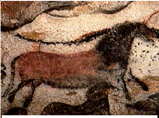
Cave painting in Lascaux, France

Now, in the Lascaux caves, most of the horses were brown and black, but other caves in China and southern France show spotted horses! So were the cave painters imagining spots or simply depicting what they saw? It has been a scientific debate for years.