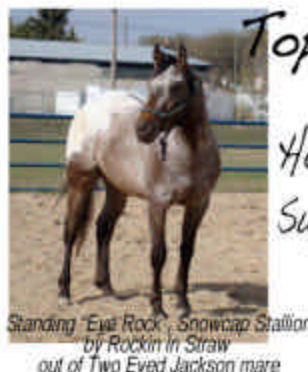
Standing Eye Rock, Snowcap Stallion by Rockin in Straw out of Two Eyed Jackson mare