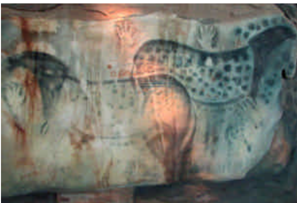
Pech Merle in southern France are feature paintings of white horses with black spots

are the ancestors of our lovely modern spotted-horses... just as the artists were our ancestors. Now breathe that in. Early people working on simple scaffolding, painting images of their lives, on the walls and ceilings of caves – expressing their celebration of life, their spirituality and connections with their environment. They did it artistically with charcoal, iron and manganese pigments. Amazing when you think it was tens of thousands of years ago... and with the same passion we have for our horses.... and I couldn’t help but share the news.